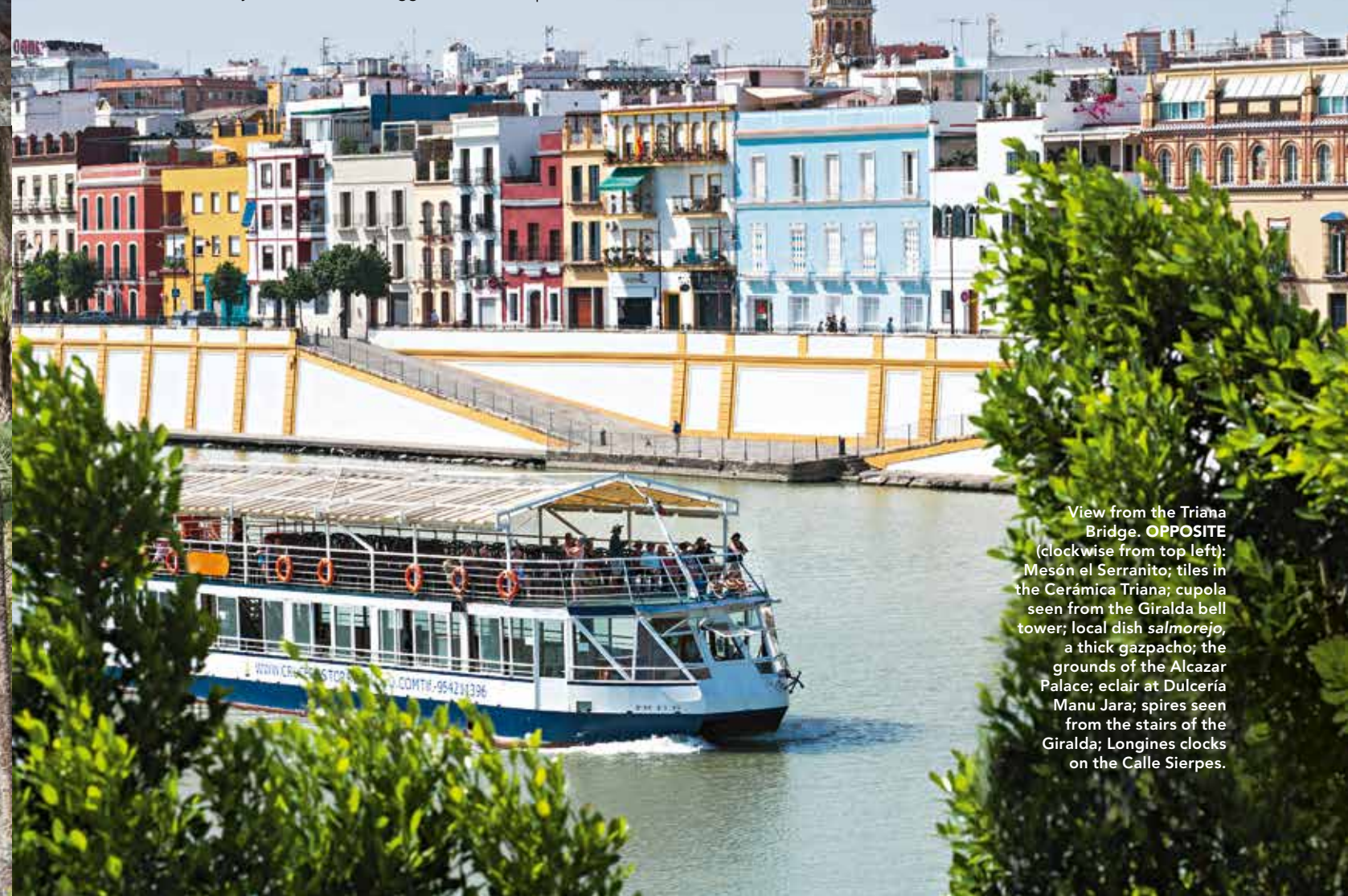
View from the Triana Bridge. OPPOSITE (clockwise from top left): Mesón el Serrano; tiles in the Cerámica Triana; cupola seen from the Giralda bell tower; local dish salmorejo , a thick gazpacho; the grounds of the Alcázar Palace; éclair at Dulcería Manu Jara; spires seen from the stairs of the Giralda; Longines clocks on the Calle Sierpes.