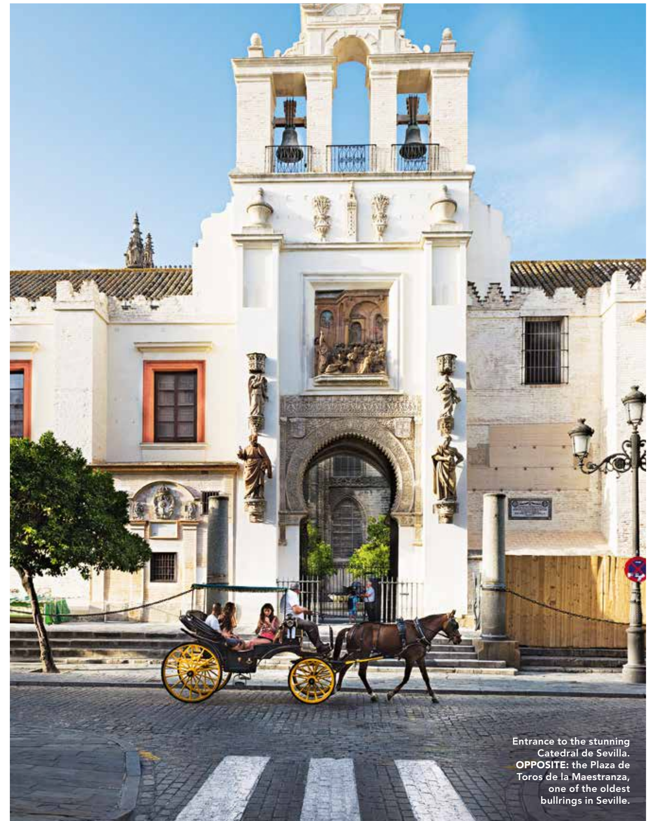
Entrance to the stunning Catedral de Sevilla. OPPOSITE: the Plaza de Toros de la Maestranza, one of the oldest bullrings in Seville.