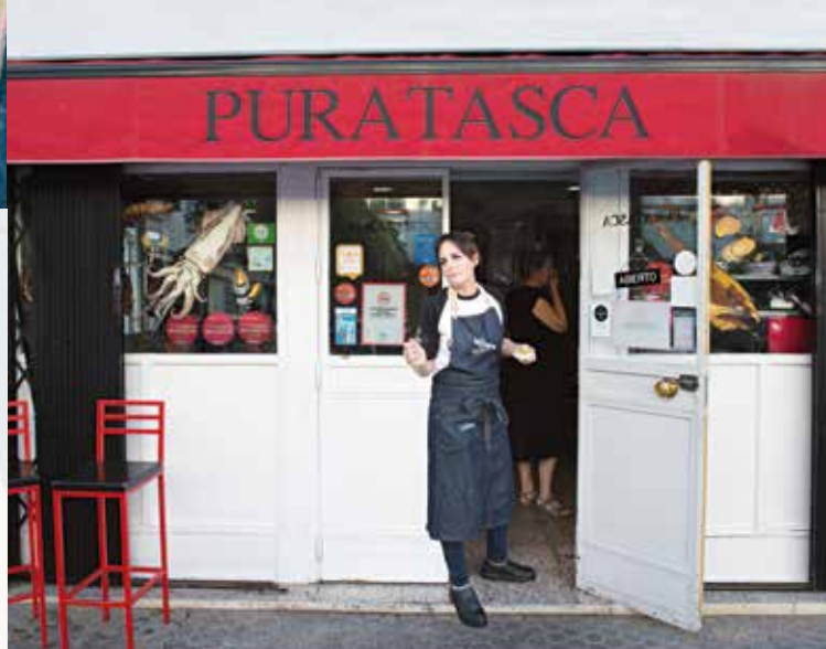
CLOCKWISE (from left): Great casual diner Puratasca; Plaza Mayor; cool off in the pool at Hospes Casas del Rey de Baeza; Plaza de Toros; Rita de Casia at the Convento de San Leandro; Avenue de la Constitucion.

In a more residential area, but still conveniently located, the Hospes Casas del Rey de Baeza (Plaza Jesus de la Redencion, 2) occupies a converted complex of apartments around two rustic, flower-filled courtyards, with spacious lounge and reading areas, as well as a glamorous rooftop pool and spa. ( mrandmrsmith.com/luxury-hotels/hospes-las-casas-del-rey-de-baeza ) ✂